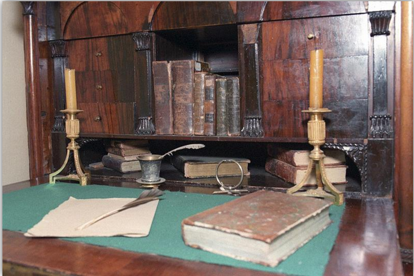
Pushkin's writing table