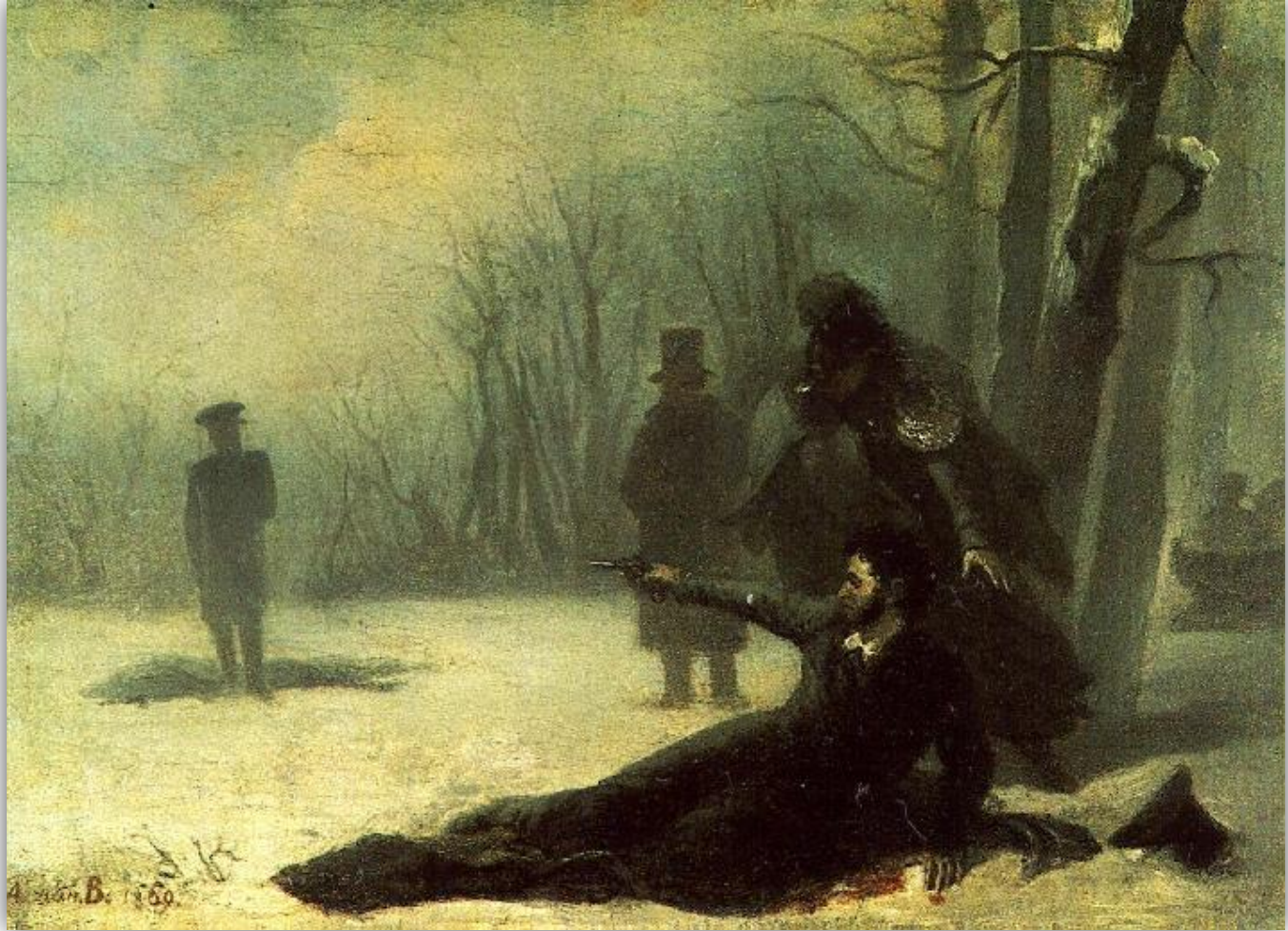
Duel of Alexander Pushkin and Georges d'Anthès