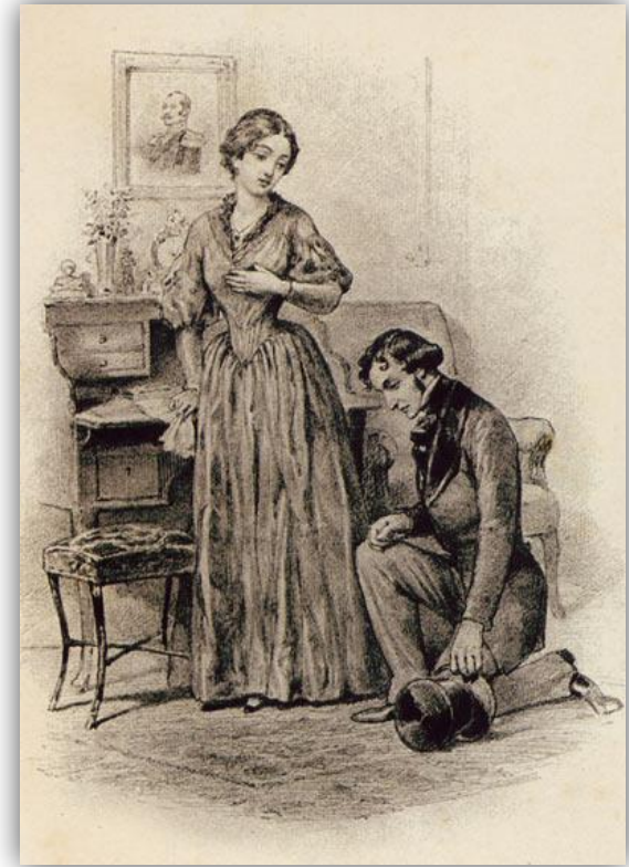
Onegin proposes to Tatiana, late 19th century illustration by Pavel Sokolov